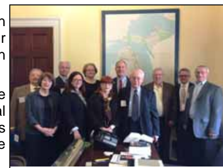
Rep. John Moolenaar (MI-04), back row center, meets with Michigan Chrysler and Detroit Edison retirees

In the more than 70 appointments that attendees had with members of Congress and/or their staffs the following retiree issues were advocated: